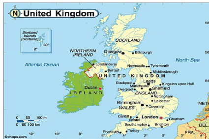
Figure 3: The geographers' presentation

The historian talks about the main monuments and a description of a festivity, focusing on what citizens usually do on that particular day.