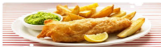
Figure 5: The gastronomes' presentation

The entertainment researcher speaks about cultural aspects such as music, bands and other important celebrities born there.