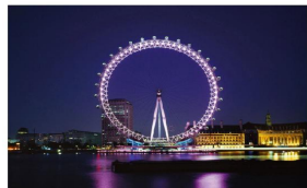
Figure 4: The historians' presentation